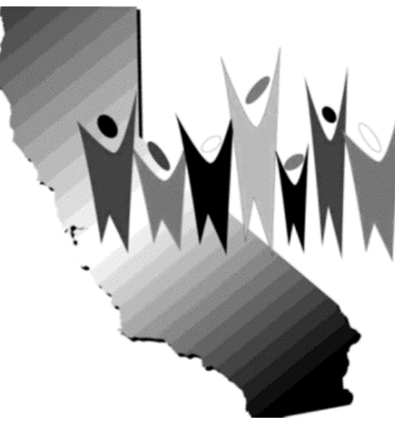
..... for people applying for or receiving public aid in California